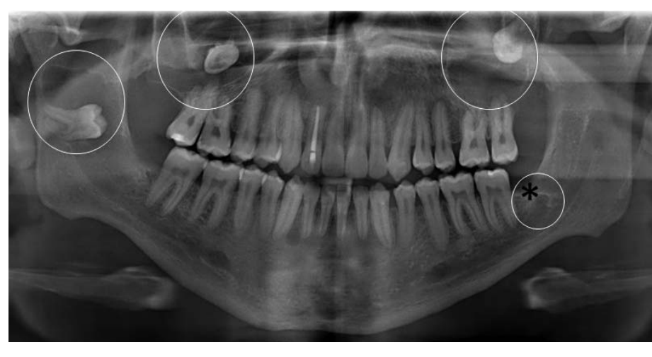
Fig. 2. Radiographic exam revealing radiolucent lesions associated to impacted teeth and agenesia of tooth 38. Size of keratocysts: 3.0\times1.7\times0.8 cm (18); 3.3\times2.1\times0.7 cm (28); 2.7\times1.5\times0.5 cm (48).