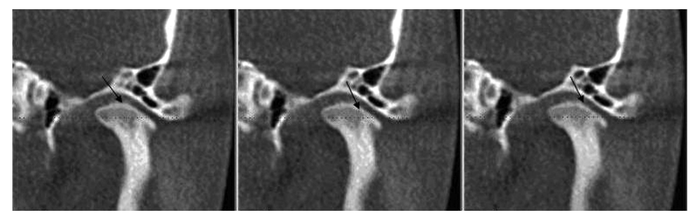
Fig. 4. Deformation of mandibular condyle, presenting subchondral sclerosis and osteophyte formation

To reject the zero hypothesis and accept the alternative hypothesis, a level of statistical significance of p \le 0.05 was used in all cases.