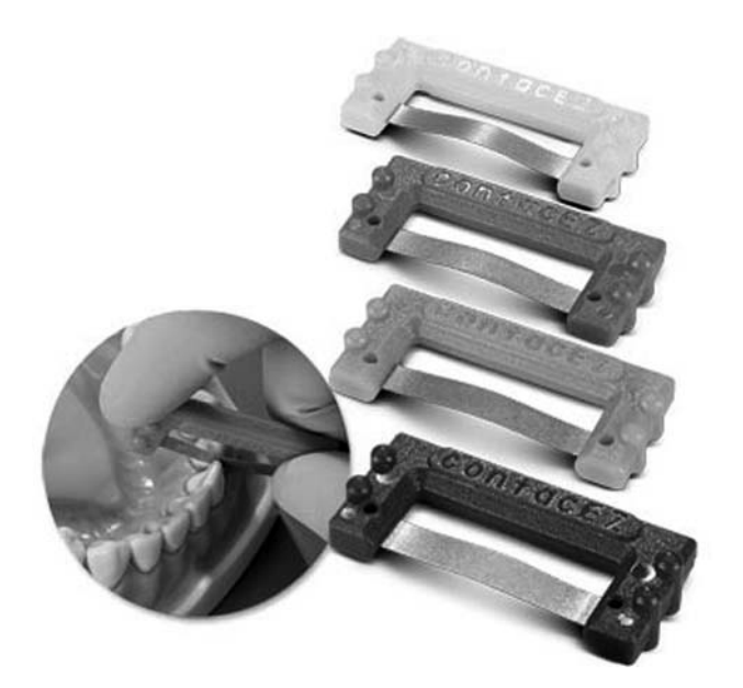
Fig. 3. "Ortho-strip" with a special holder

increased formation of plaque (4, 5, 7, 15, 22), caries (7, 8, 15), and the risk of periodontal diseases in the stripped enamel areas (Table 2).