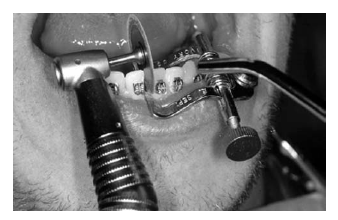
Fig. 1. Separator and air cooling during interproximal enamel reduction with the modified Tuverson technique, using a diamond disk in 4-handed approach [5].

described more than 20 years ago by Sheridan as an alternative to extraction or expansion in borderline cases (14, 28). It generates space primarily in buccal segments. Using the ARS technique, one can easily create as much space as needed, and thus there is no need to close the gaps between the teeth - which always appear after tooth extraction. The application of extraction or expansion is difficult when treating patients who more and more often choose clear plastic appliances such as Invisalign. An alternative to the treatment of mild-to-moderate crowding is ARS (23, 29). When applying ARS, the recommendation is to use burs with safety-tipped non-cutting areas to prevent furrows of the proximal walls, which can occur when using conventional burs with squaredoff tips (2) (Figure 2). "Intensive Ortho-Strips" is one more method of IER, which is currently gaining in popularity. It is used as an alternative to ARS. Ortho-strips are thin, semi-flexible strips used in a special holder (Figure 3). Intensive Proxo shapes are flexible thinner blades that can remove very small amounts of the intermolar enamel to provide banding space if separation has not been effective (14). This technology takes more time than ARS, but the results are more predictable, and the enamel surface will be smoother than that achieved when using burs