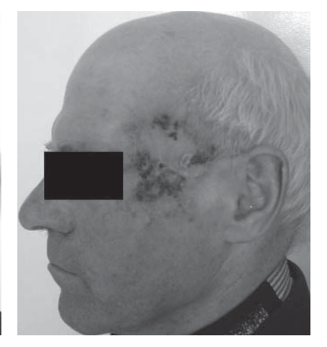
Fig. 4. View before operation