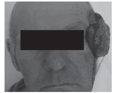
Fig. 1. View before operation